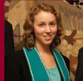
Scripps College Class of 2009

“Using the knowledge and technical skills gained through the Scholars Program to help non-profit institutions is deeply fulfilling, and I am energized by my diverse and committed colleagues.”