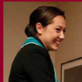
Pitzer College Class of 2010

“My last four years have been amazing. Thanks to the Scholars Program and Pitzer College, I’ve had experiences and opportunities that I never would have imagined. I look forward to beginning this next phase in my life.”