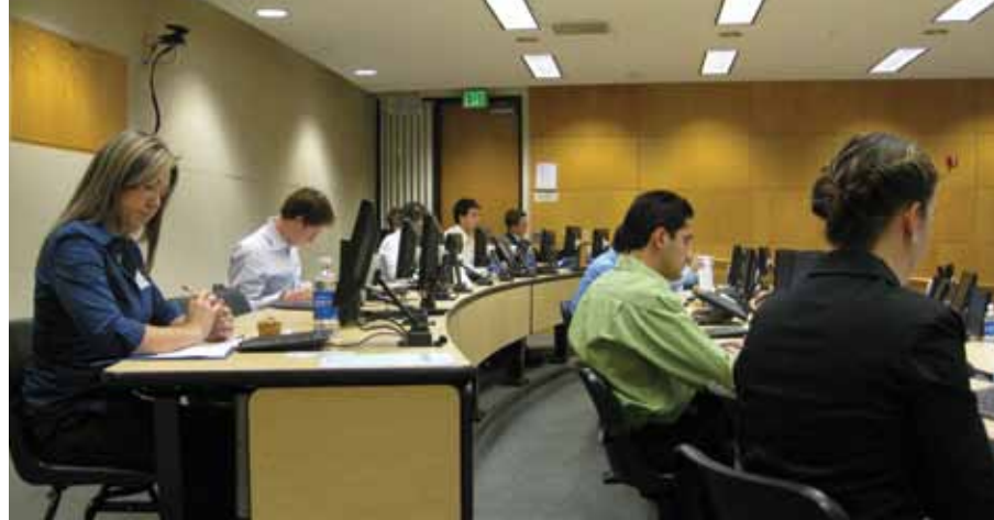
▲ Applicants participate in the in-box portion of the Leadership Assessment

All applicants are expected to be available for each progressive stage of the application process. Students studying off-campus participate in alternate, but comparable activities.