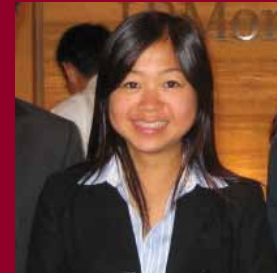
Pomona College Class of 2011

"I did not know there were so many Claremont College alumni in Asia! Before the RDS Asia Networking Trip, I never considered contacting alumni in Asia, but now I have hundreds of contacts."