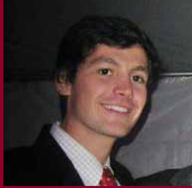
Clarmont McKenna College Class of 2010

“Despite the fact that I am a Philosophy major, the Robert Day Scholars program has been a phenomenal opportunity for me to learn how to interpret the prodigiously important economic and financial events of the current day.”