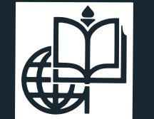
Claremont McKenna College

1976: Claremont Men's College becomes a coeducational institution.